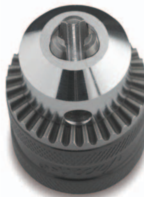
MULTICRAFT WITH WAISTED AND KNURLED FINISH

JACOBS NORTH AMERICA World Headquarters and U.S. Factory One Jacobs Road P.O. Box 592 Clemson, SC 29633, USA Phone: 864.654.5926 Fax: 864.654.5001