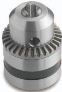
MULTICRAFT WITH GROUND FINISH AND BLACK BAND

Note: Please contact your Jacobs Chuck sales representative for available finish options.